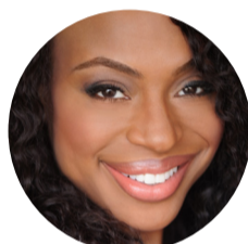
Kinnik Sky ACTOR