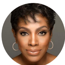
Sheryl Lee Ralph ACTOR