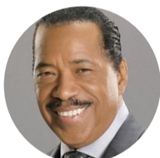
Obba Babatundé ACTOR