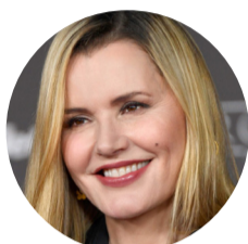
Geena Davis FOUNDER | Geena Davis Institute on Gender in Media OPENING REMARKS

stage reading from the book with panel discussion following